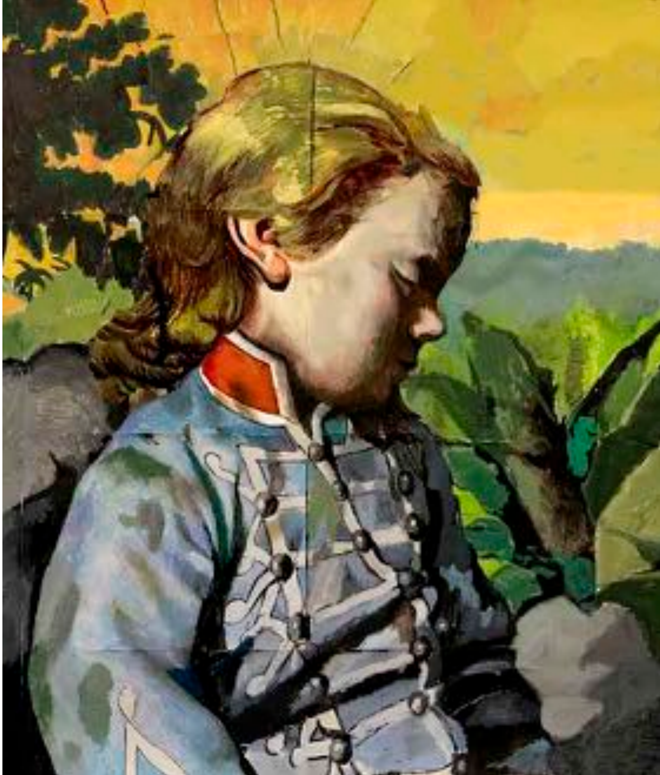
ACRYLICS ON SHEETS OF PAPER JOINED TOGETHER 94X107 CM, 2021