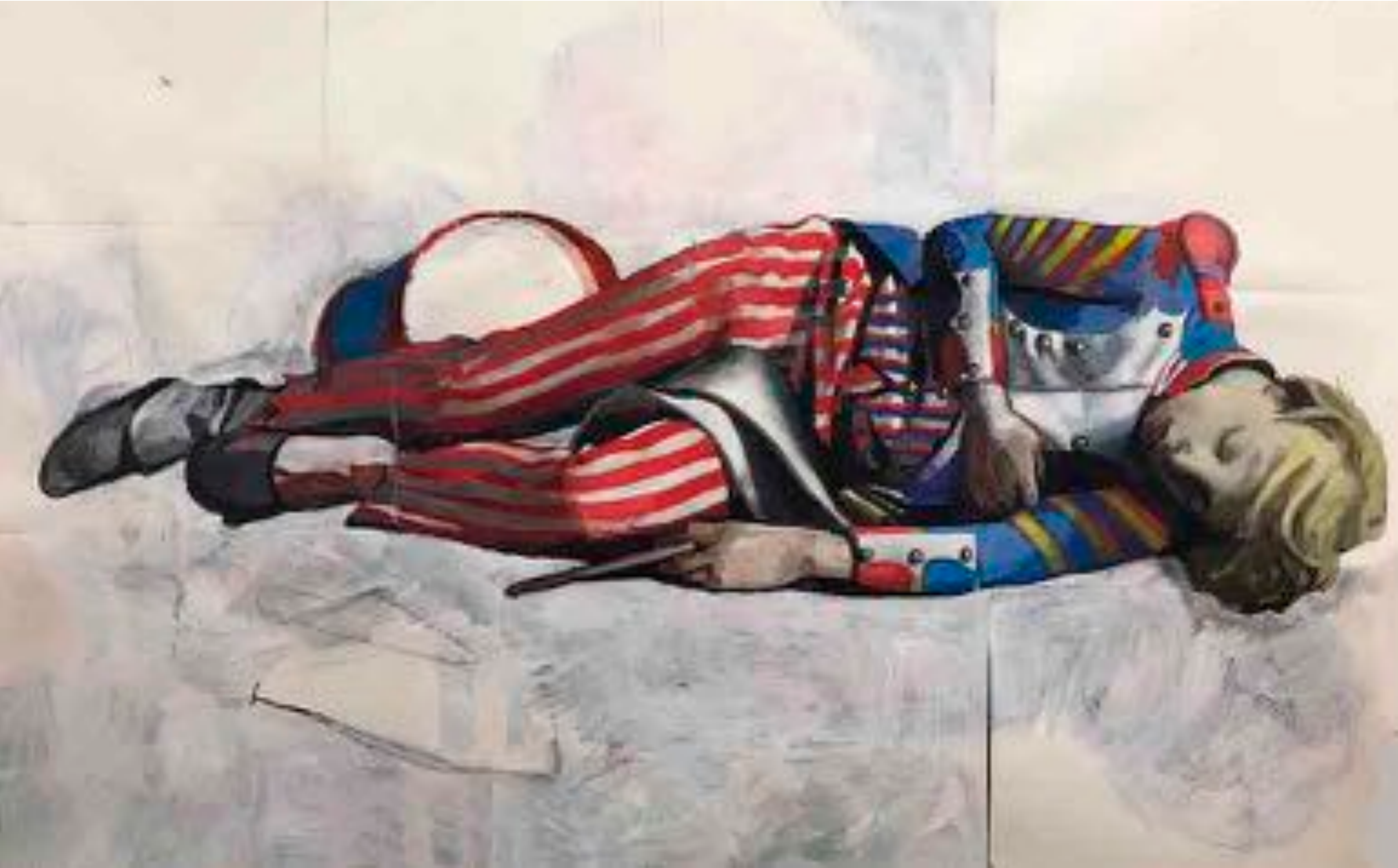
ACRYLICS ON SHEETS OF PAPER JOINED TOGETHER 168X108 CM, 2021