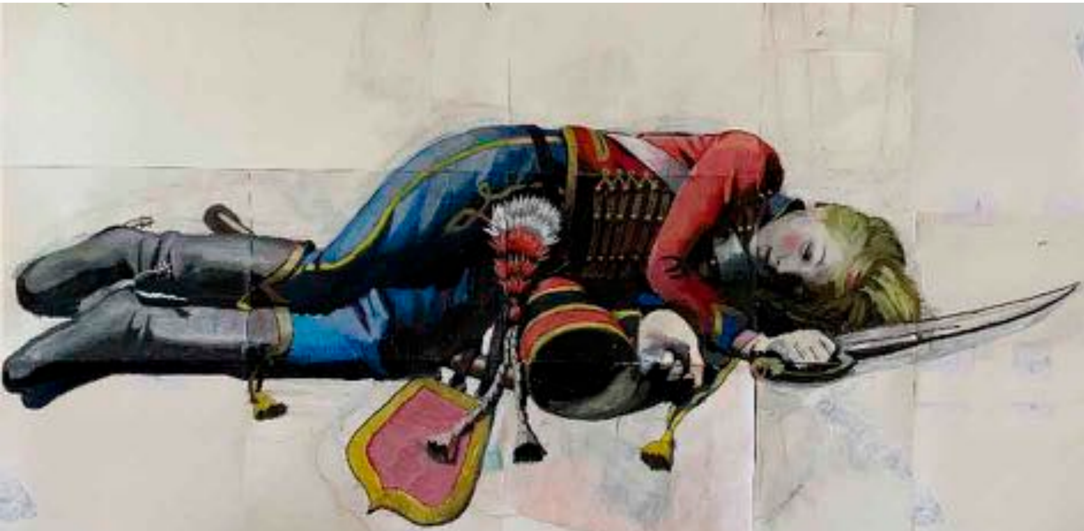
ACRYLICS ON SHEETS OF PAPER JOINED TOGETHER 214X108 CM, 2021