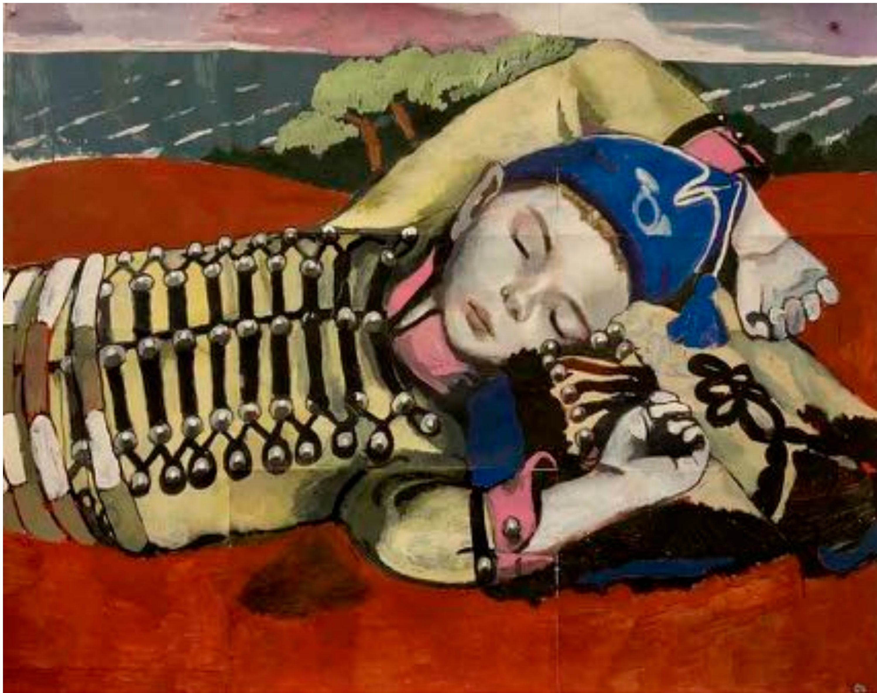
ACRYLICS ON SHEETS OF PAPER JOINED TOGETHER 107X94 CM, 2021