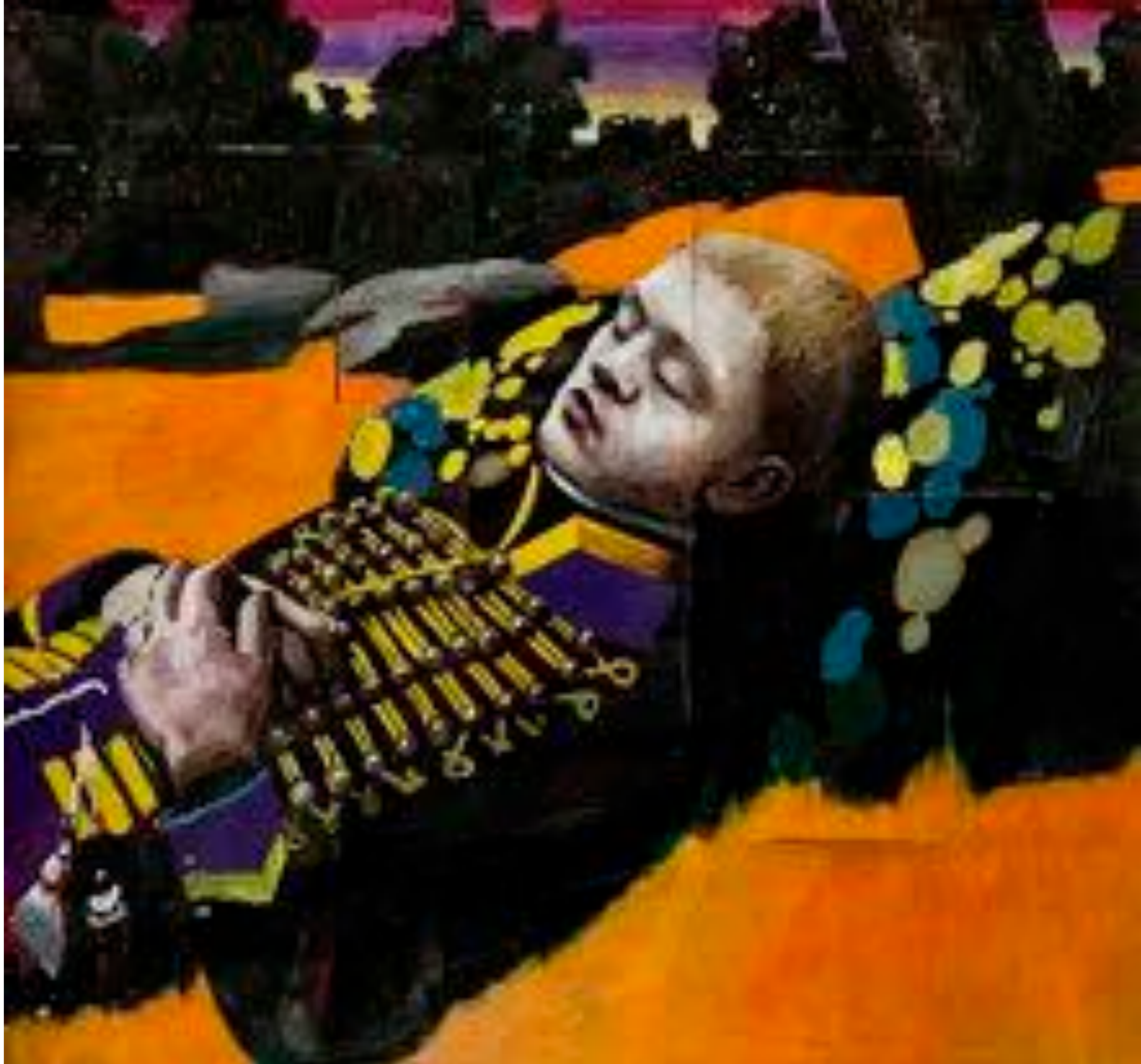
ACRYLICS ON SHEETS OF PAPER JOINED TOGETHER 93X99 CM, 2021