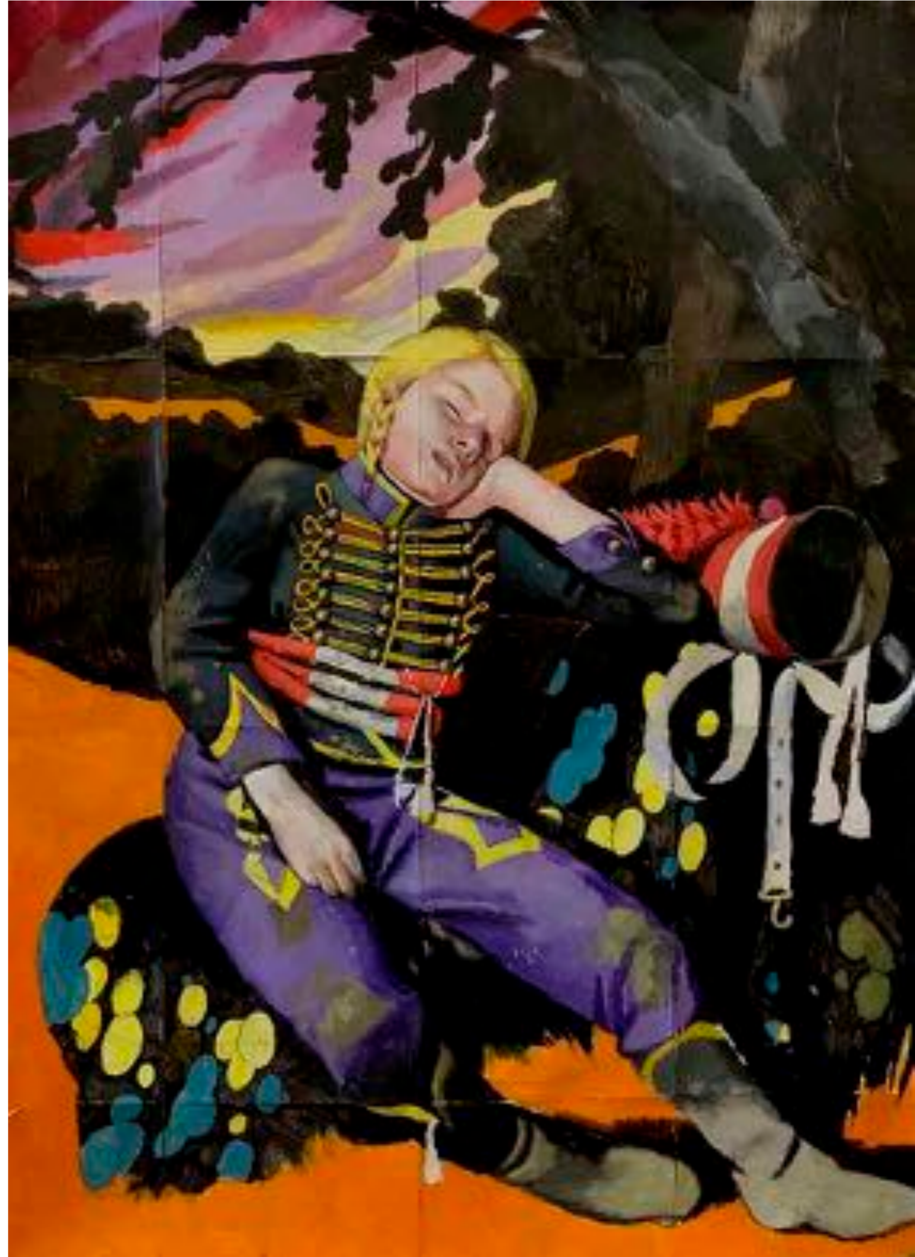
ACRYLICS ON SHEETS OF PAPER JOINED TOGETHER 119X165 CM, 2021