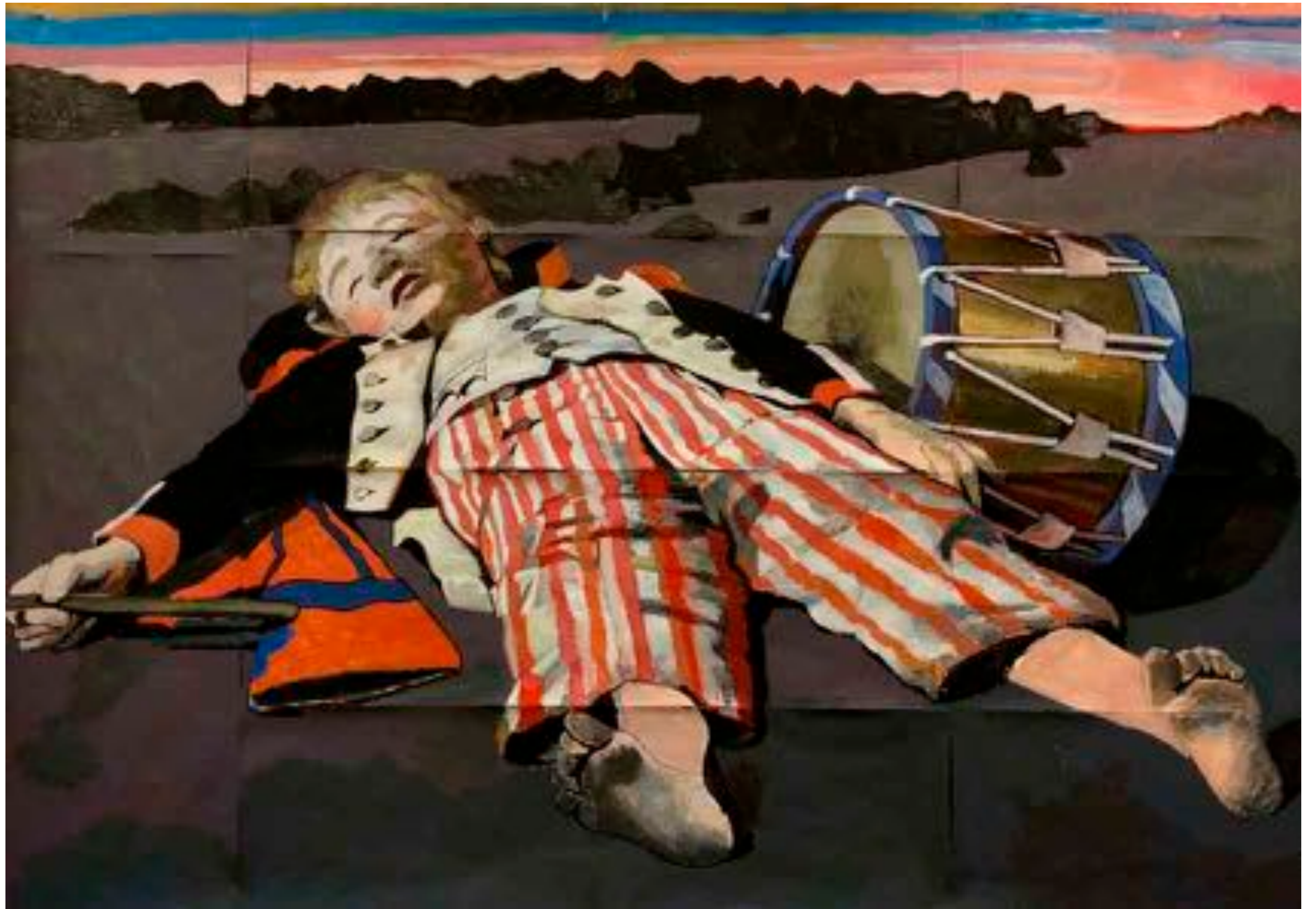
ACRYLICS ON SHEETS OF PAPER JOINED TOGETHER 176X130 CM, 2021