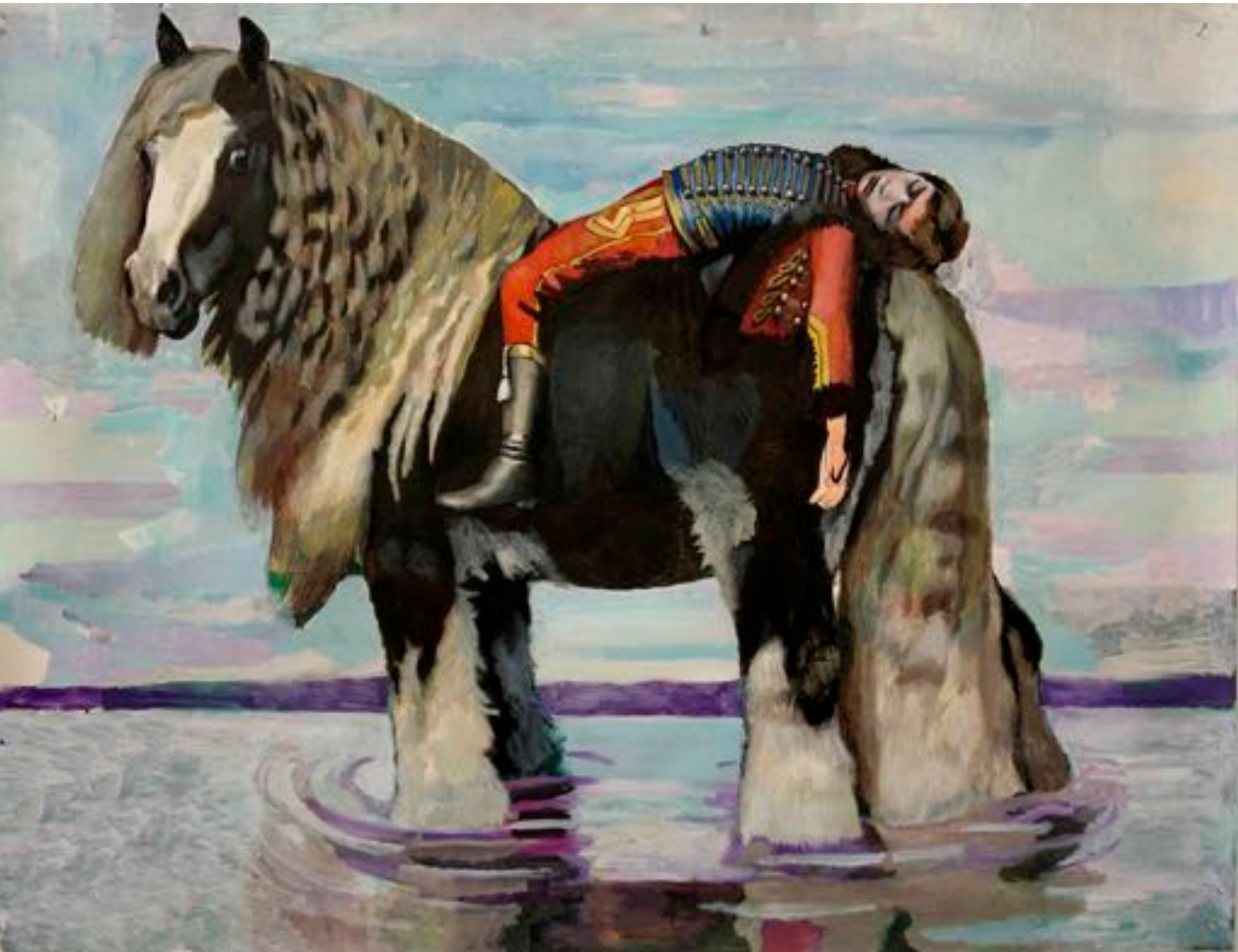
ACRYLICS ON A SINGLE SHEET OF PAPER 200X152 CM, 2021