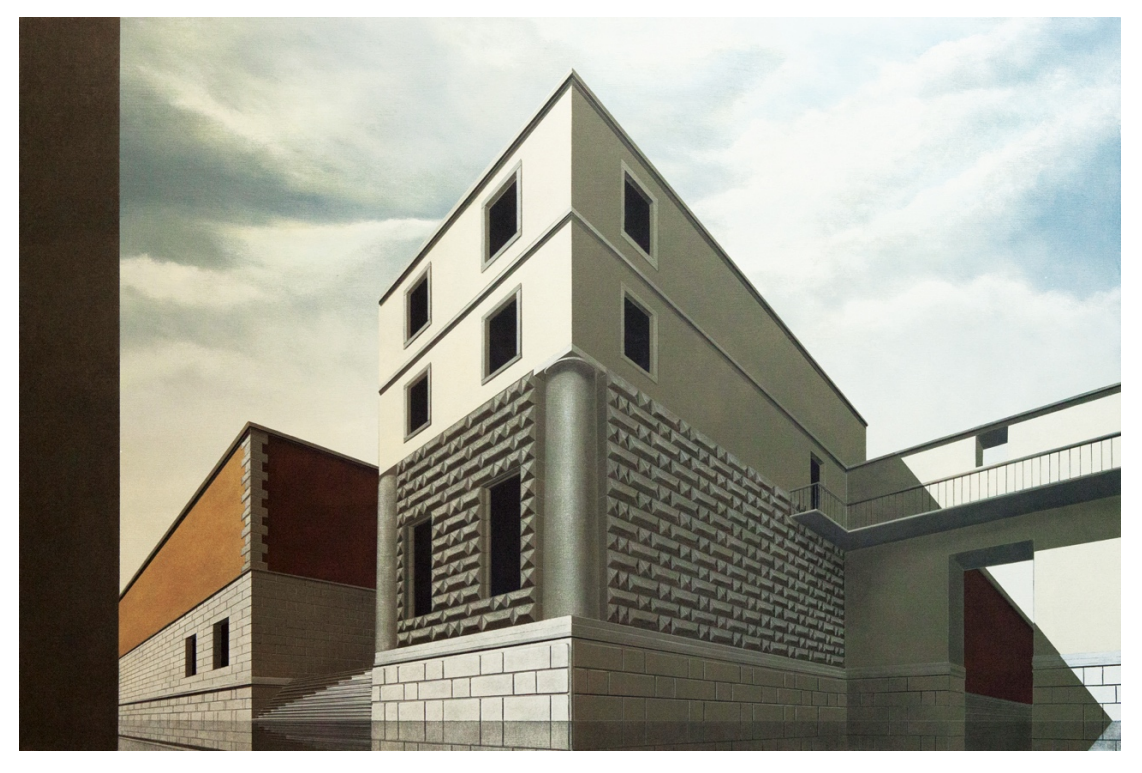
Arduino Cantàfora - Capriccio Venezian, 2014 - Vinilico e olio su tavola - 80x120cm