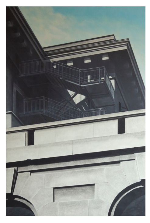
Arduino Cantàfora Stazione Centrale, 2014 - Vinilico e olio su tavola - 120x80cm