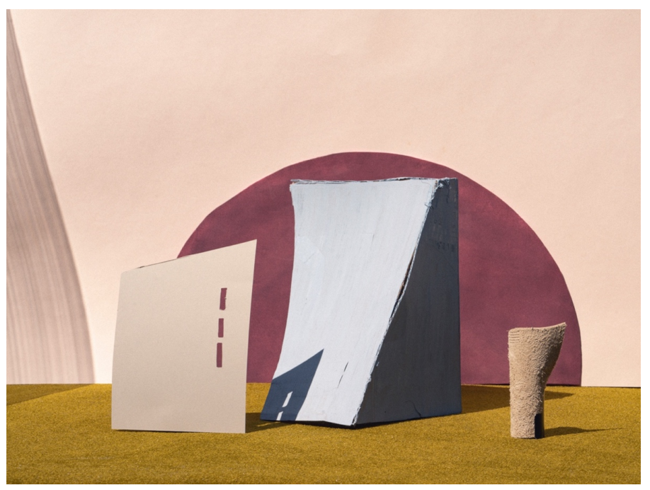
Delfino Sisto Legnani Alessandro Mensi Senza Titolo, 2023, stampa fotografica fine art su carta cotone, 50x70 cm